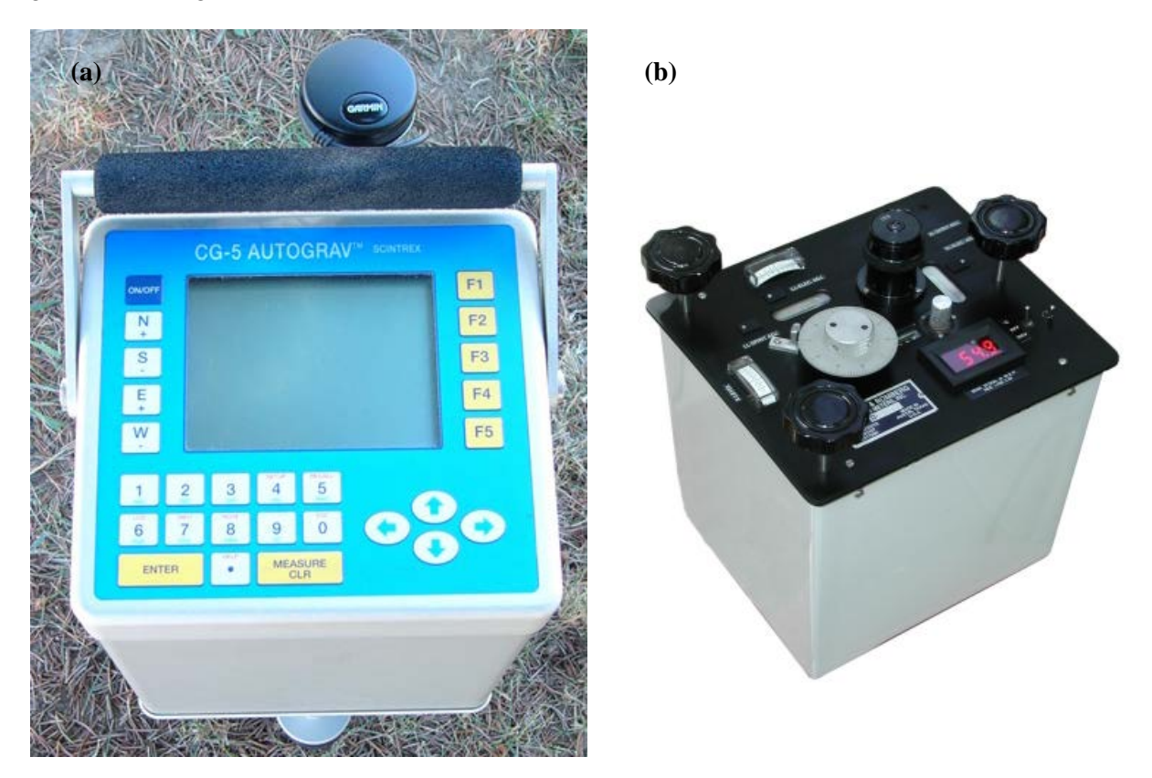
FIGURE 2: Some commonly used gravity meters (a) Scintrex CG-5 Autograv (b) Lacoste & Rhomberg gravity meter

There are two types of gravity instruments: an absolute and a relative gravimeter. An absolute gravimeter is a highly precise tool applied to reservoir monitoring and subsidence studies usually used in microgravity study. The commonly used gravimeter in geophysical exploration applications is the relative gravimeter. The LaCoste and Romberg and Scintrex instruments are the most commonly used gravimeters (Figure 2).