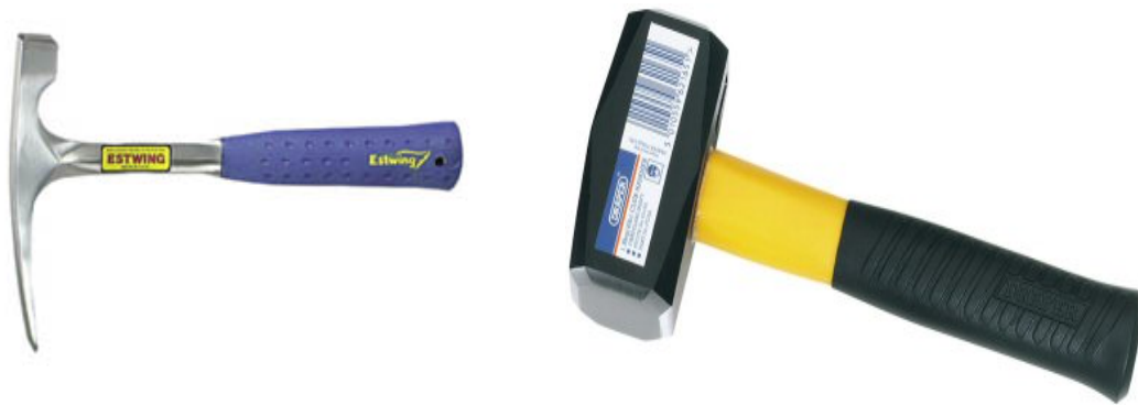
FIGURE 3: Chisel head and crack geological hammers