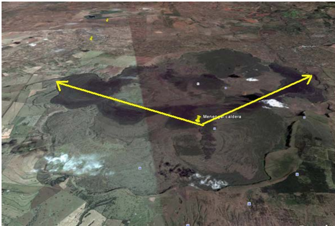
FIGURE 4: Satellite image of Menengai caldera. The dark lava flows on trachytic eruptive centres imply orientation to the northeast and northwest and these can be inferred as structures.

Geothermal manifestations. Geothermal manifestations, whether hot springs, fumaroles, altered or hot ground, geysers, steam jets or sulphur deposition, must be mapped and their extent measured. All observable characteristics should be fully described and photographs taken. Intrusive rocks must be analysed in detail making note of their composition, quantity, orientation and if any sequences can be identified they should be numbered accordingly. All new mineralisation should be sampled regardless whether the same formation has been sampled elsewhere.