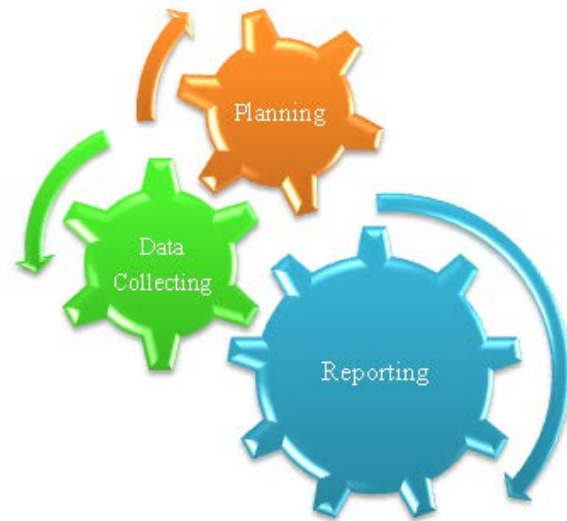
FIGURE 2: Phases of geological field mapping