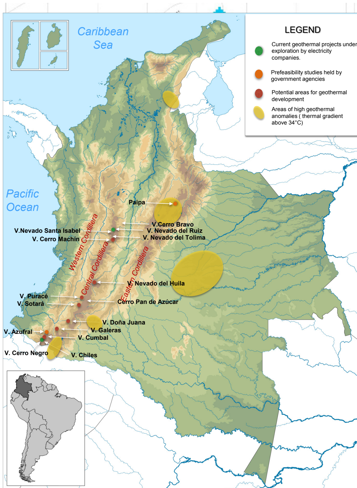
FIGURE 1: Geothermal potential zones in Colombia