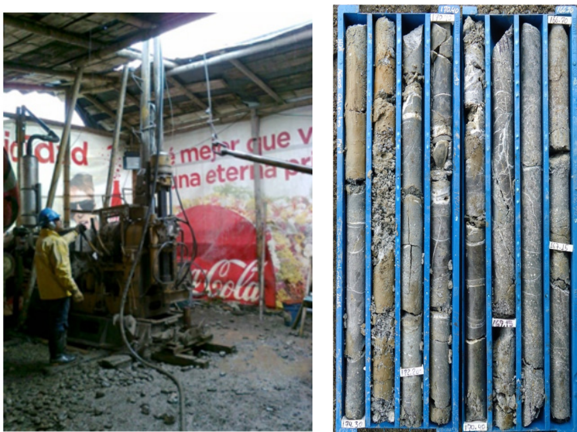
FIGURE 3: Left, rig used for TGW 1; Right, cores obtained, mainly andesites with fracture zones and propilitic alteration crossed by calcite veins